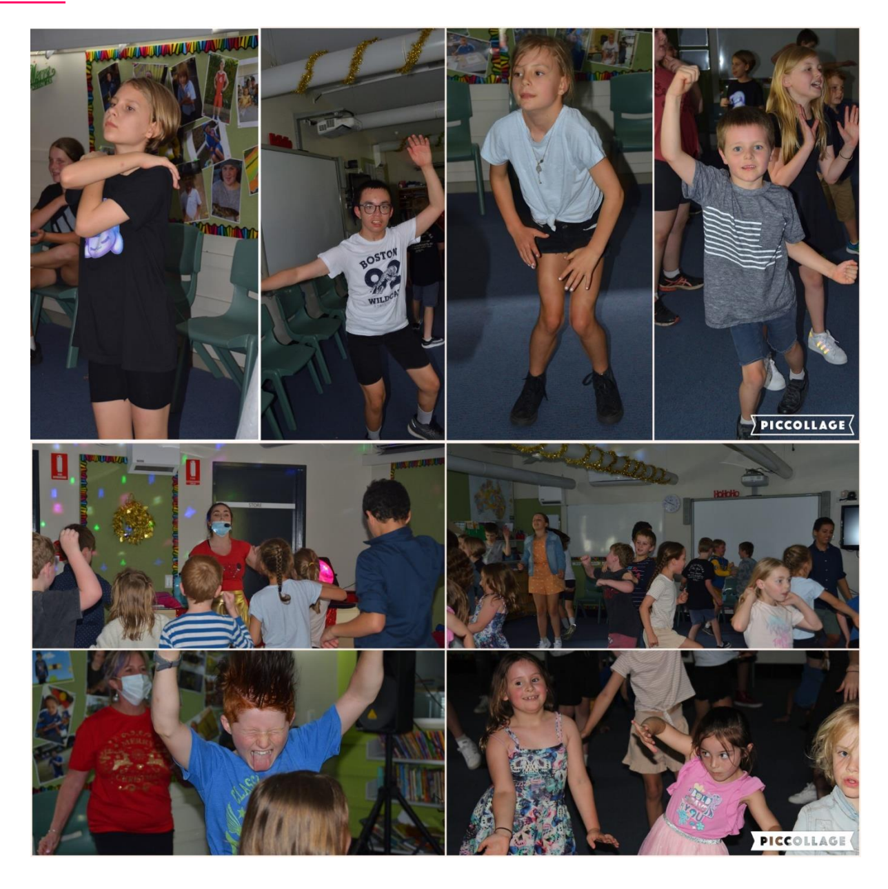
End of Year School Party and Water Fun Day